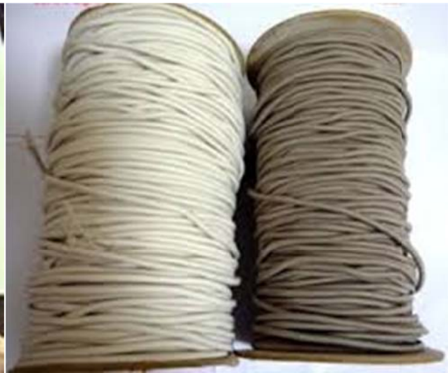
Elastic String for Buttons