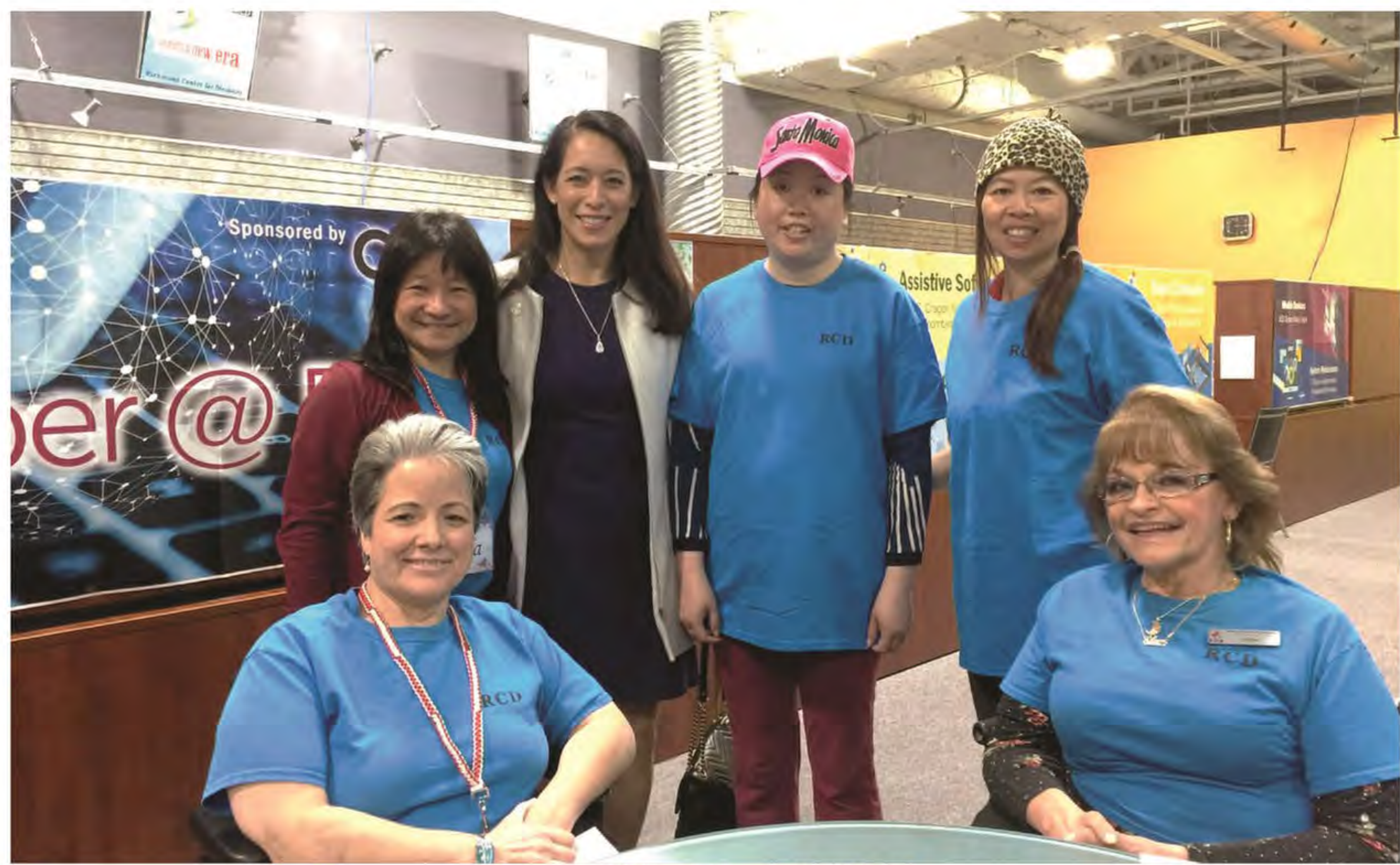
2019 RCD Invisible Illness Forum – Shine A Light