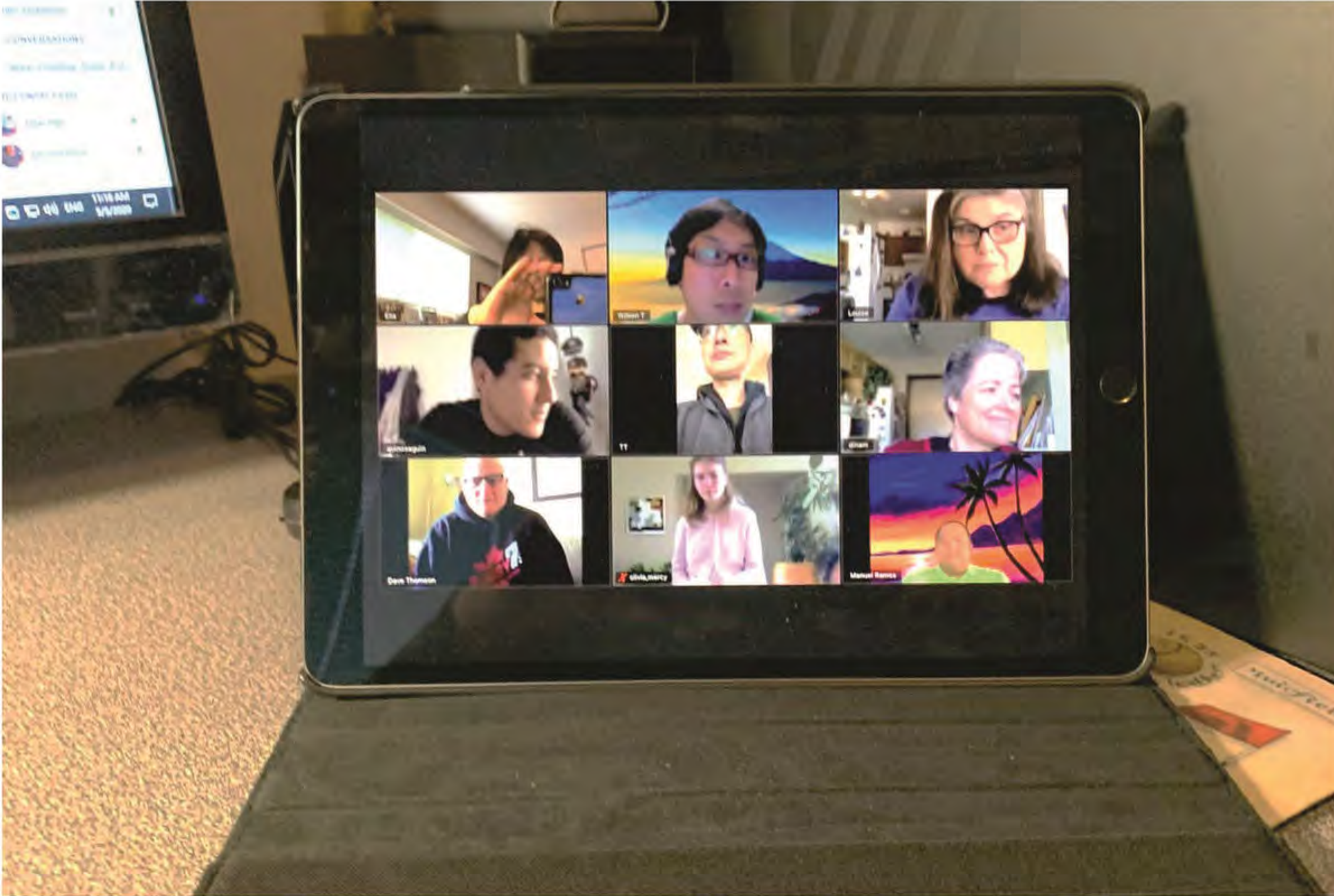
2020 We are all Zoom-Zoom