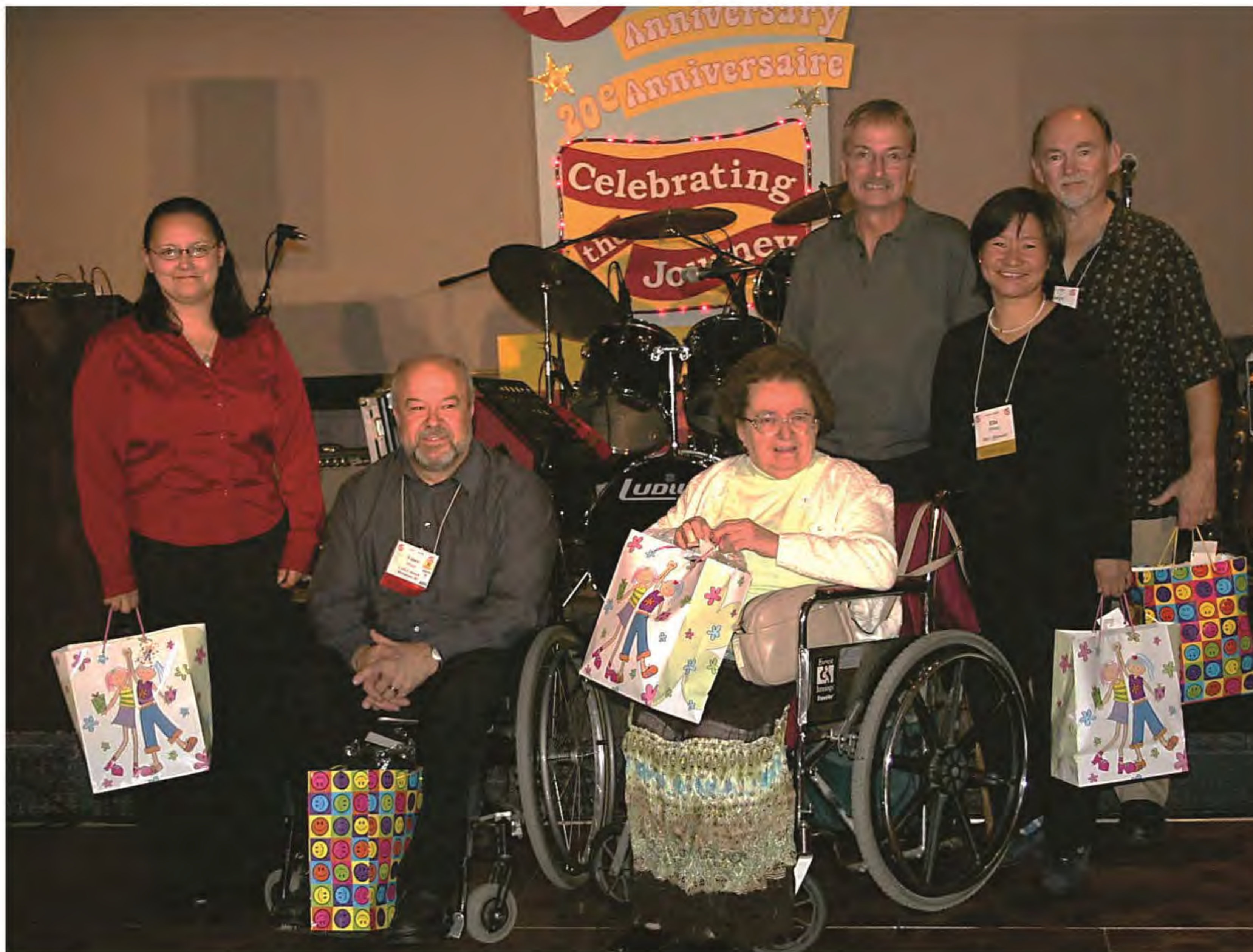
2006 RCD at Independent Living Canada Banquet