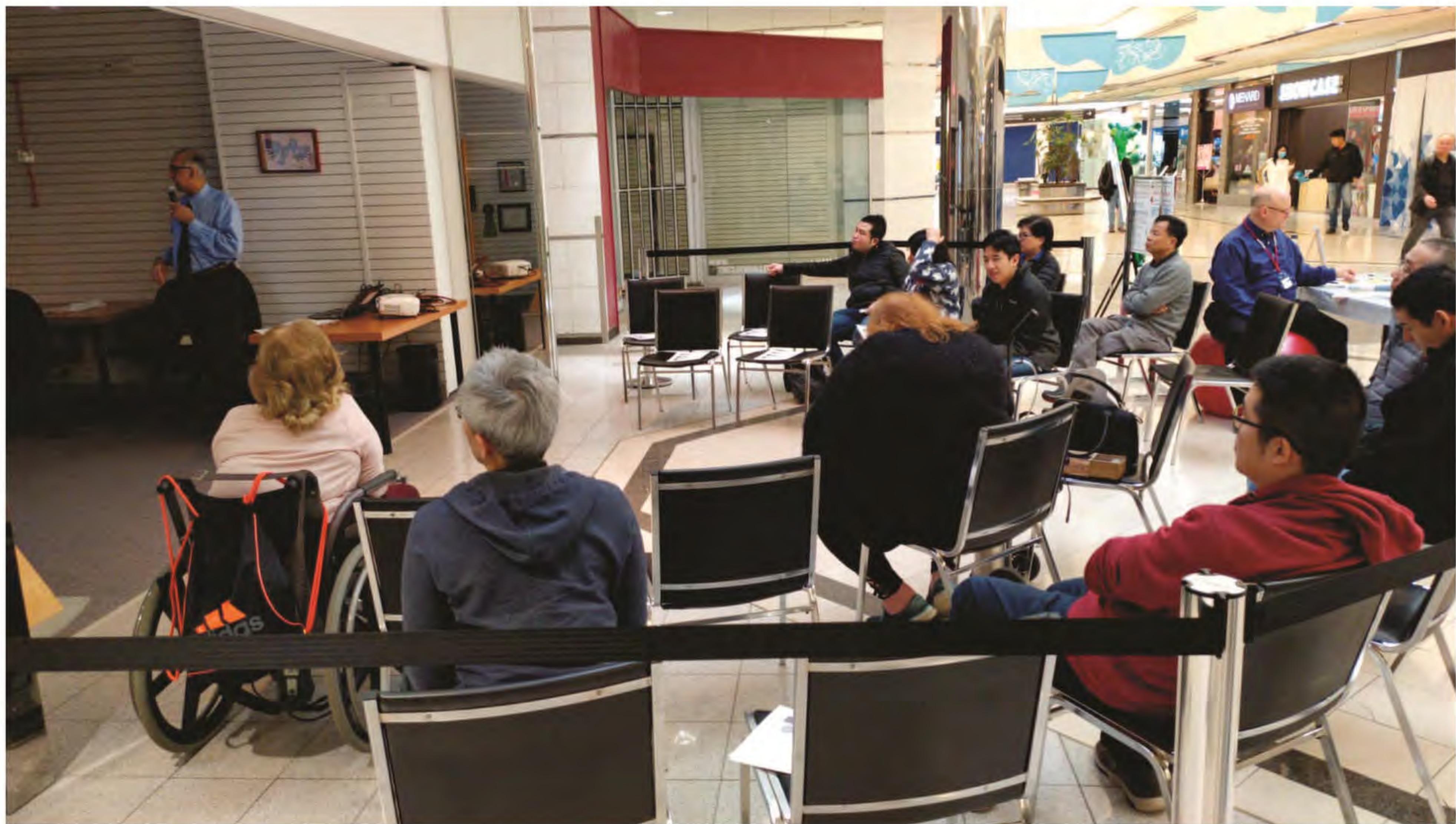
2020 RCD Empowered Wellness Event – Financial Literacy